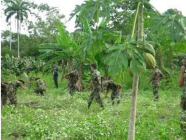
Fig. 1. Manual eradication of a coca field in Chapare, Bolivia.

Another U.S. effort encouraged farmers to replace coca with other crops, like coffee, bananas, and pineapples. Alternative crop programs seem like a good idea because they will get rid of the coca farms, but they have their own drawbacks. First, as coca grower Leonida Zurita-Vargas noted in her 2003 New York Times opinion column, transporting heavy fruits like pineapples from the mountainous coca-growing regions is expensive and difficult. Second, growers are seldom willing to give up coca farming because they can make more money by selling coca than any other crop. Even with government incentives for alternative cropping, coca remains more profitable, a big inducement for poor farmers who can barely support their families and send their children to school. The Houston Chronicle reports that even in areas where farmers have planted alternative crops, the farmers are being lured back to the coca plant by larger profits (Otis). One coca farmer asserted that by growing coca, he could “make ten times what he would make by growing pineapples or yucca” (Harman). Ultimately, alternative cropping means less coca production overall, which will drive up coca prices and encourage more farmers to abandon their alternative crops and return to coca.