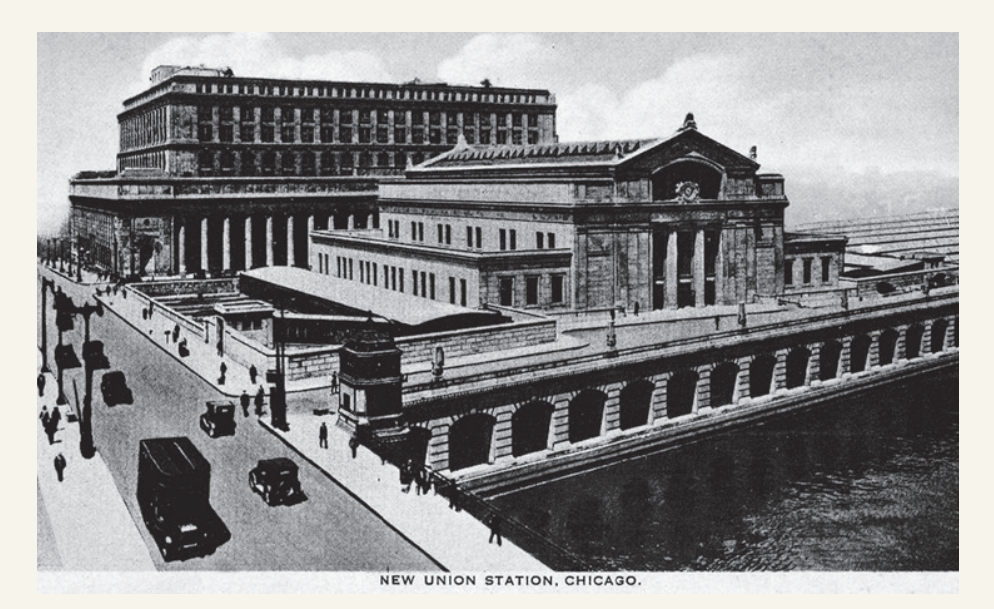
Fig. 3. Union Station, circa 1925.

The effectiveness of an earnest but open-minded approach to urban planning has already been proven in Chicago. Union Station (fig. 3) is one project that worked to the satisfaction of both developers and preservationists. Developers U.S. Equities Realty Inc. and Amtrak proposed replacing the four floors of outdated office space above the station with more practical high-rise towers. This offer allowed for the preservation of the Great Hall and other public spaces within the station itself. "We are preserving the best of the historical landmark . . . and at the same time creating an adaptive reuse that will bring back some of the old glory of the station," Cheryl Stein of U.S. Equities told the Tribune . The city responded to this magnanimous offer in kind, upgrading zoning on the site to permit additional office space and working with developers to identify exactly which portions of the original structure needed to be preserved. Today, the sight