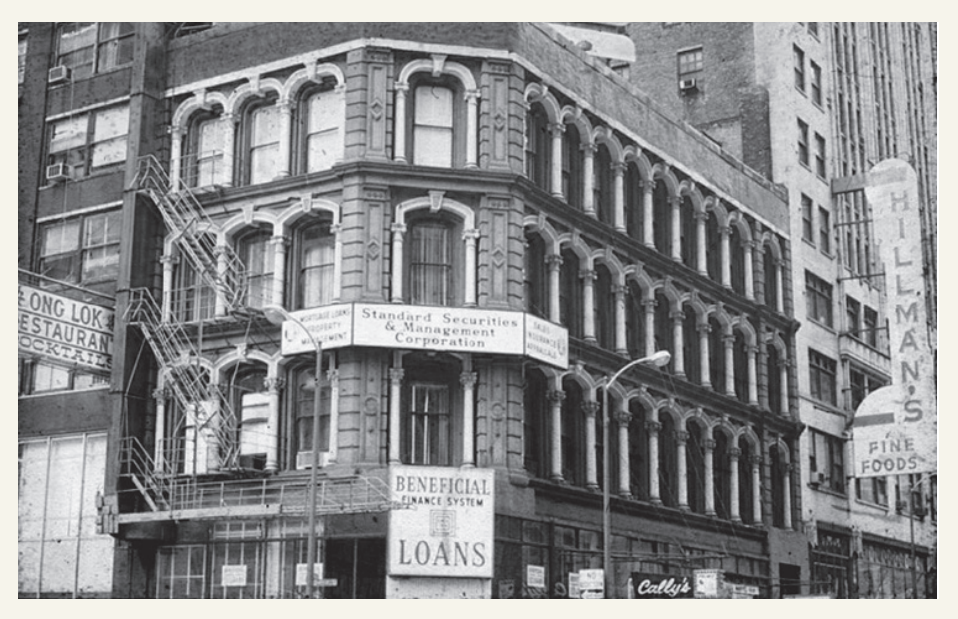
Fig. 2. The McCarthy Building.

Source of image quoted in figure caption.